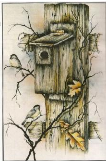
“Last Days of Autumn”