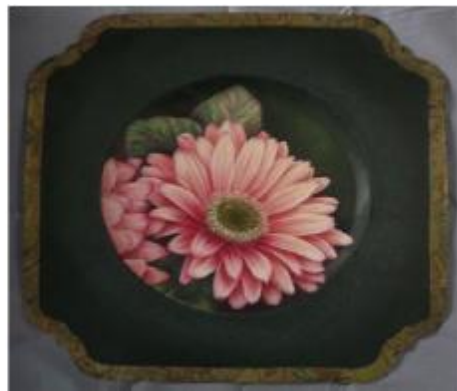
Gerbera Daisy - OIL