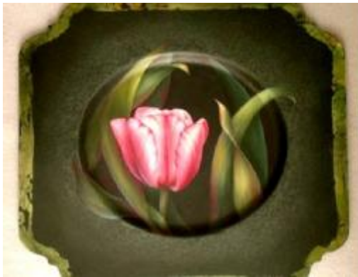
Tulip - OIL